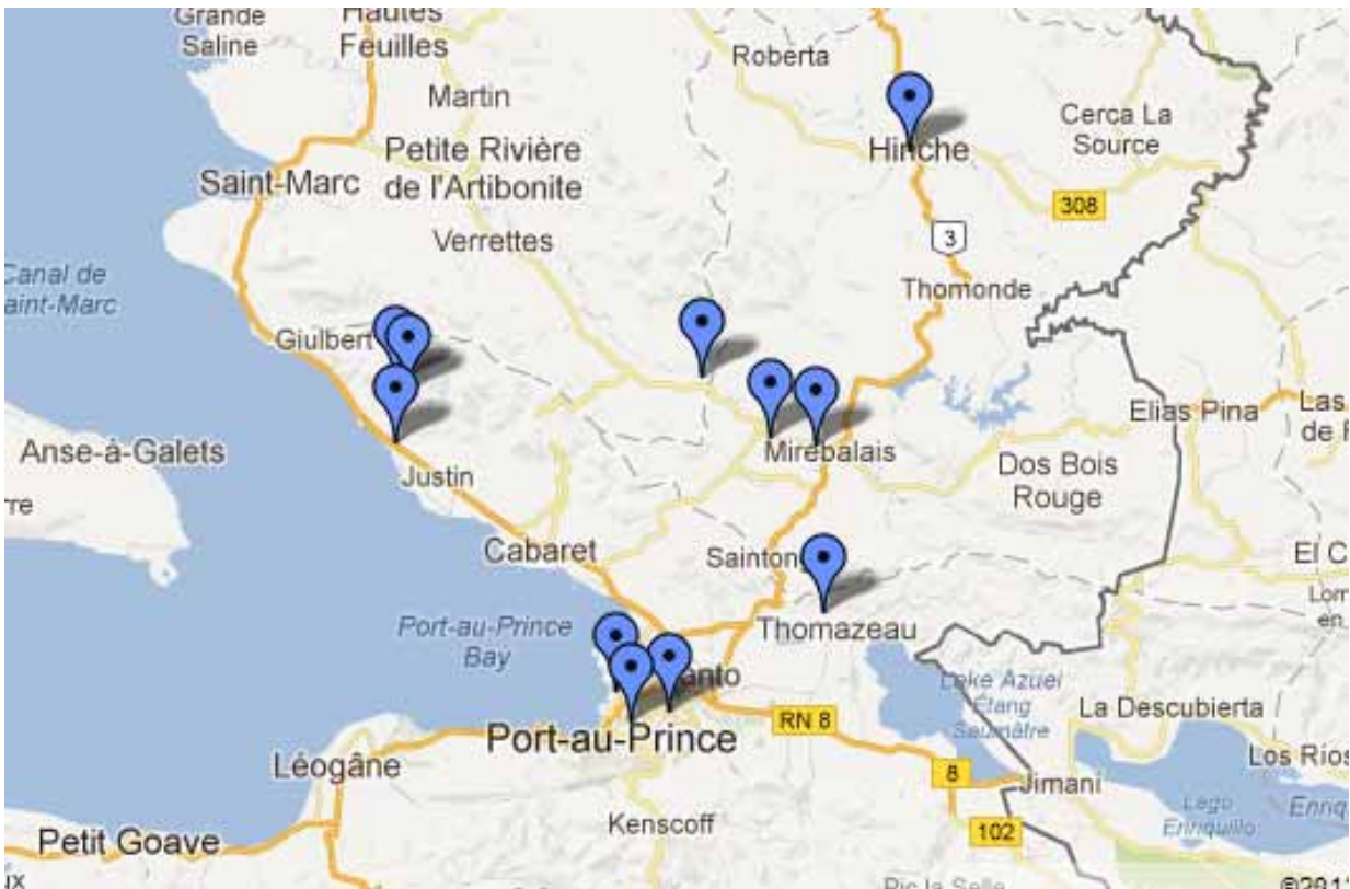
Hope for Haiti's Children Sponsored Schools 2014

Hope for Haiti's Children will now support 10 Christian schools, having constructed the Thomazeau Christian Primary School through RH2020 efforts. Continual improvements to each of these schools will vary but may include: computer training facilities, additional classrooms, school lunch programs, playground areas, security gates, and roofing. In addition, regular teacher training programs and teacher evaluation programs will be added.