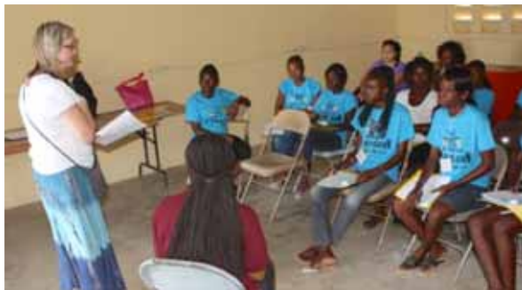
Small Group Lessons (with a translator)