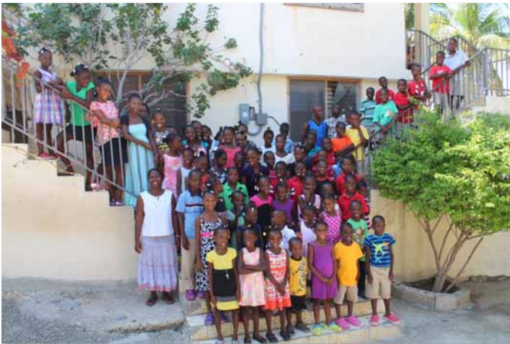
Home to 72 children – in front of their dormitory