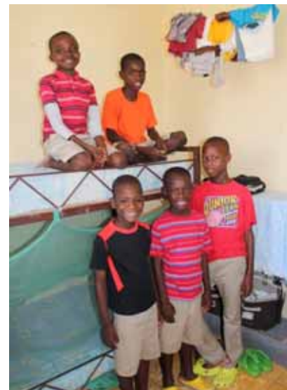
Three bunkbeds are in each room.