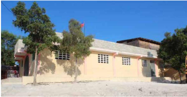
CAZEAU CHRISTIAN PRIMARY SCHOOL

This outstanding school educates 162 children. For the past 7 years, students achieved an impressive pass rate of 100% on their 6 th grade national exams! To continue this quality education and to comply with new government mandates, grades 1 st -4 th are needed to be constructed on the 2 nd floor.