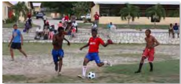
Futbol Games on grass, not concrete!