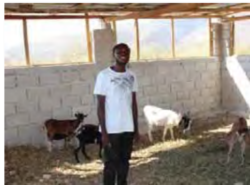
Projects - organic raised-bed vegetable gardens, fruit tree farm, egg production, meat goats, cattle, and tilapia pond